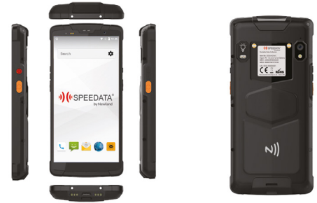
SD55 from all sides